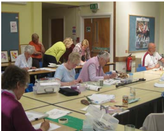
Friday Art Class in action

Over recent years we have sought to enable the development of small “health businesses” around people’s skills and qualifications. Six now occupy rooms in the Centre and are podiatry, sports massage and therapy, osteopathy, complimentary therapies, and counselling. In addition yoga and pilates attend once a week. Members of all these groups often attend other activities in the Centre and look at the various community notices available and ask for help about the Deepings in general. We also offer space to Citizens’ Advice, Alzheimer’s’ Support, Rethink, and four art groups to mention just some. This year has seen the development of a small language school. French, German, Italian and Spanish are on offer at present and we have provision for Chinese if there are sufficient takers.